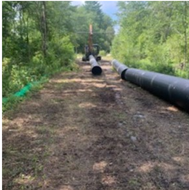
Photo 1: Staging of 20-inch HDPE Sewer Force Main in Cross Country Easement