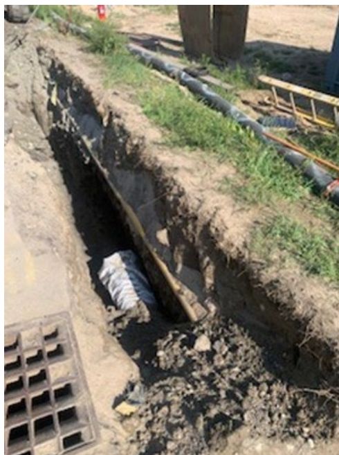
Photo 2: Installation of the 20-inch PVC Sewer Force Main with Restrained Joints on Auburn Street