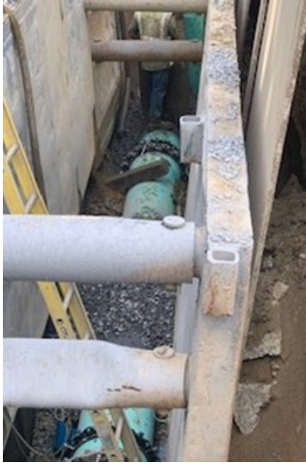
Photo 2: Installation of the 20-inch PVC Sewer Force Main with Restrained Joints on Auburn Street