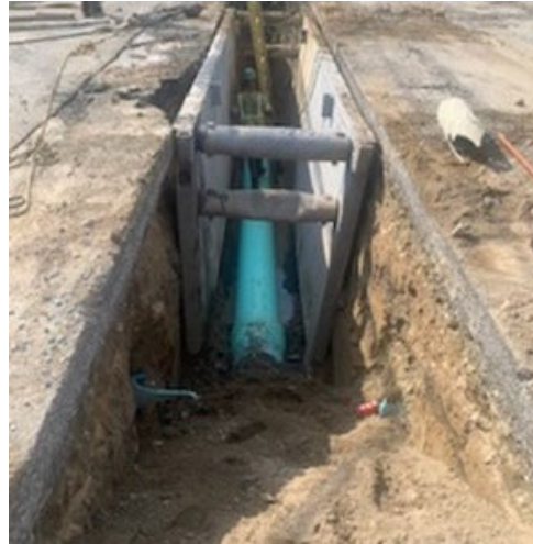
Photo 1: Installation of 20-inch PVC Sewer Force Main on Auburn Street