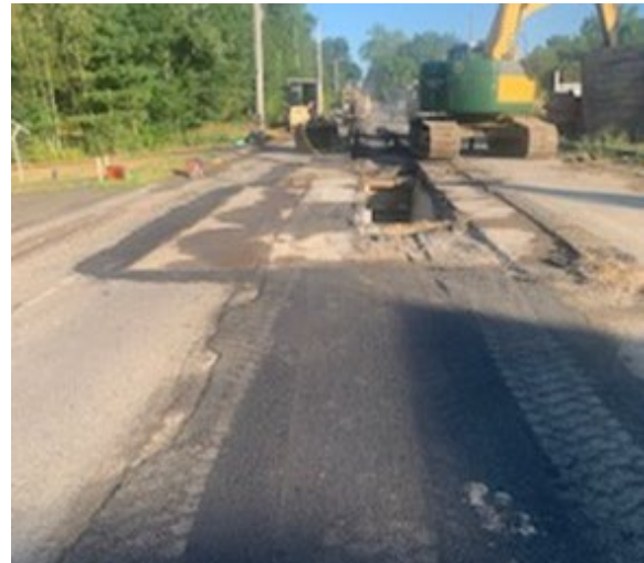
Photo 3: Installation of 20-Inch PVC Sewer Force Main on Auburn Street